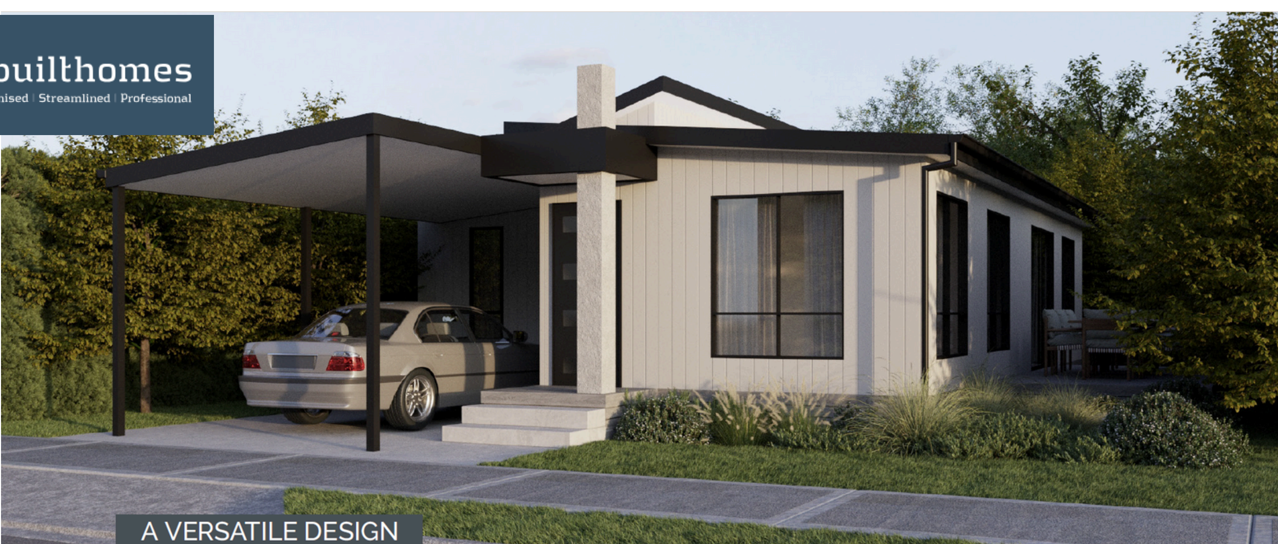
A VERSATILE DESIGN